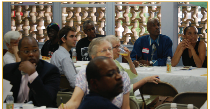
Faith leaders listen attentively to the testimonies of formerly homeless persons.