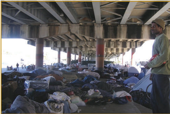
Claiborne Ave. homeless camp in 2008

In a staff meeting in early August, the nine members of the UNITY Welcome Home Outreach Team discussed how their work seeking out homeless people has changed since Katrina. Below is a summary of their thoughts.