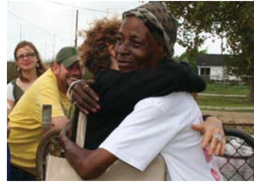
U.N. delegate shows support and friendship to UNITY client