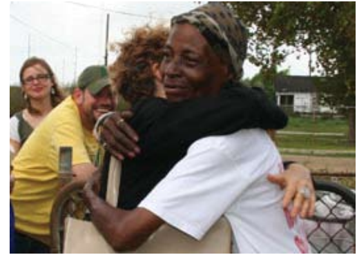
U.N. delegate shows support and friendship to UNITY client